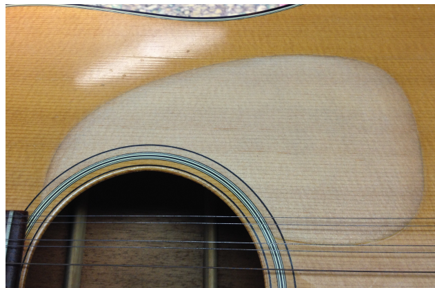
No finish under pickguard (Martin)