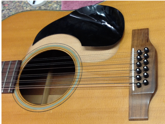
“Potato chip” pickguard

When glue lets go on the pickguard of your old stand-by acoustic guitar (in this case a '70s vintage Martin D12-20) you get the “potato chip” effect. The pickguard curls as it shrinks and pulls away from the top. Left uncorrected, this can damage the top and seriously interfere with playing. Fortunately, the solution is easily managed. Pickguard is removed with mild heat.