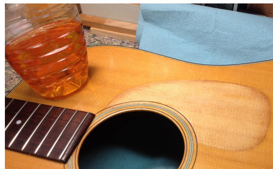
Exposed spruce treated (vintage lacquer)