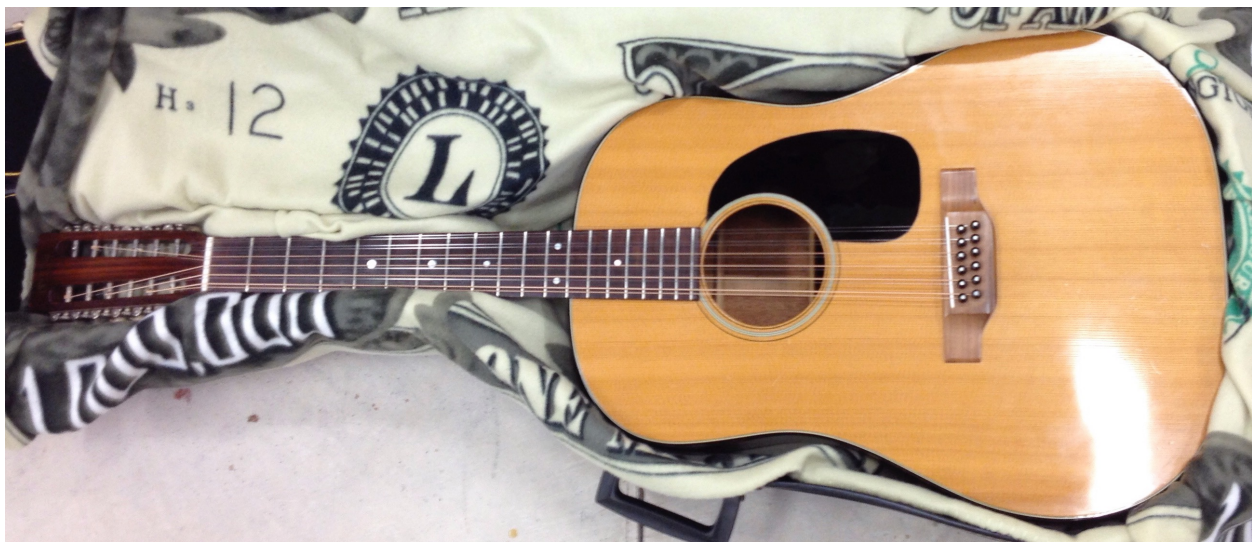
New pickguard fits perfectly; a vintage Martin lives to plan another day!